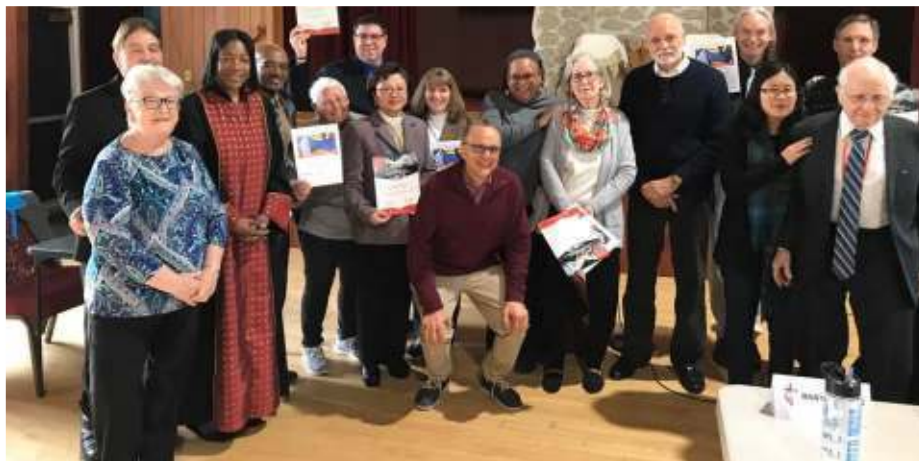
Picture of churches, pastors and lay leaders receiving certificates for 100% paid apportionments.