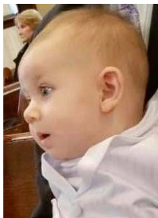
Baptized: November 24, 2019