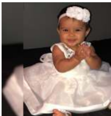
Baptized: July 21, 2019