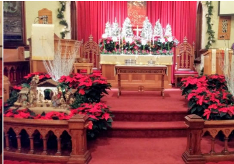
The Altar Christmas Eve