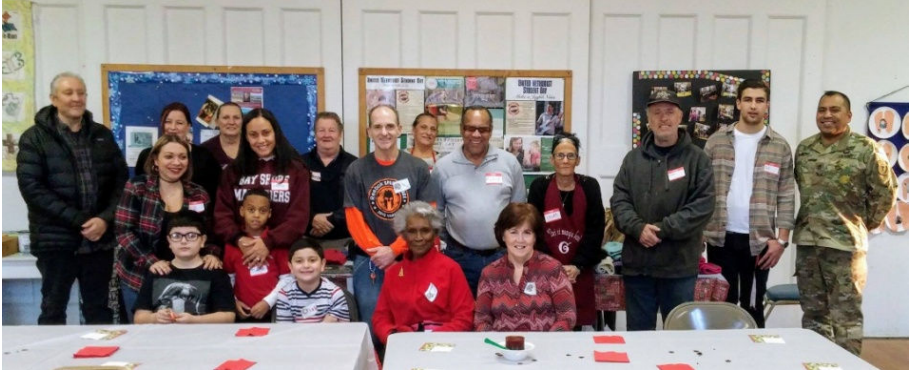
Volunteers at the Soup Kitchen Christmas Dinner served over 55 folks the best holiday meal in town - because none of us cooks as well as all of us together - and sent guests home with takeout dinners and gifts of caps, gloves, and scarves