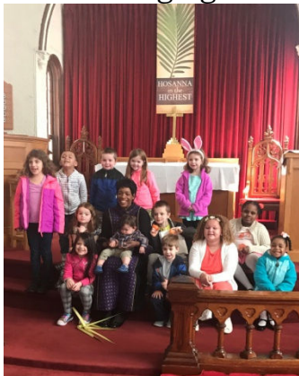
With the Children on Palm Sunday