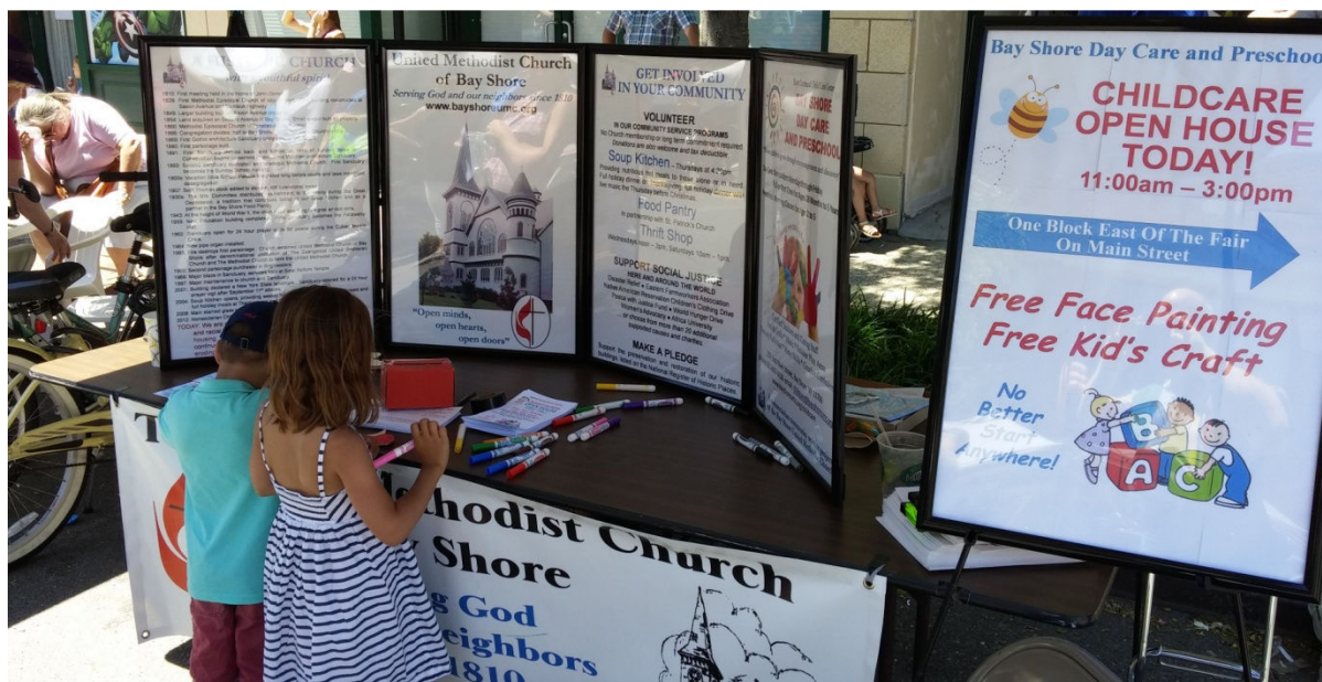
Young visitors at the Church table last year

Join us on Sunday June 11 th from 11am to 3pm as we take part in the annual Bay Shore Music and Art Fair. Stop by and help staff the Church table on Main Street. Free fish coloring craft for the kids. Invite families with children ages 18 months to 5 years to come to the Childcare Open House at the Church. Free face painting and free kids craft.