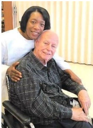
Visiting an elderly member of our congregation