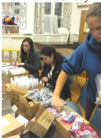
Girl Scouts making hygiene kits for the homeless.

Weddings and funerals, baptisms and confirmations. All of that and more happens at Bay Shore United Methodist Church. As pastor, I work hard to create a place where members and visitors alike are spiritually nurtured and encouraged to develop a personal relationship with God.