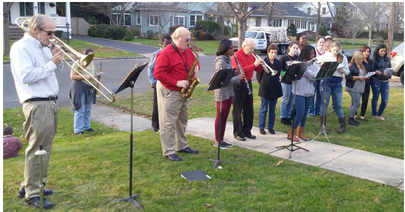
Last year the weather was so mild we caroled in shirtsleeves!