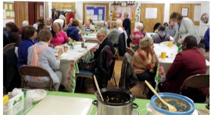
Breaking bread together.