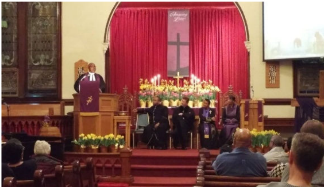
Bringing the Message.