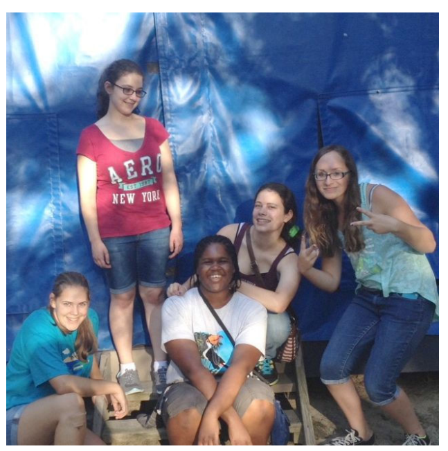
Girl Scout Troop 1651

Finance is preparing a budget for 2016 and will be presenting at our Church Council meeting on October 18<sup>th</sup> and at Charge Conference on October 24<sup>th</sup>.